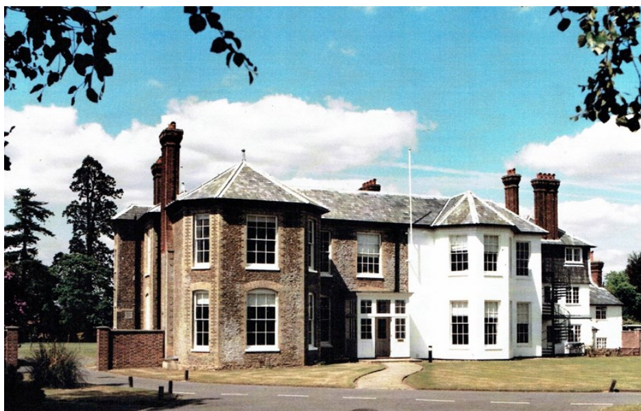
ABOVE REAR VIEW

Interior: original plain staircase, some panelled doors in architraves, and